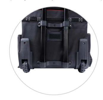
Easy to move with the heavy duty telescoping handle and rubber wheels