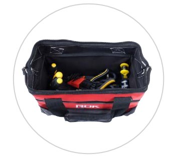
Wide opening allows easy access to tools and parts